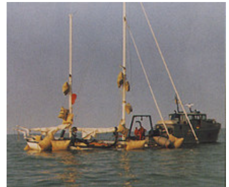
Ferro-cement sailboat salvage using Enclosed Flotation Bags.