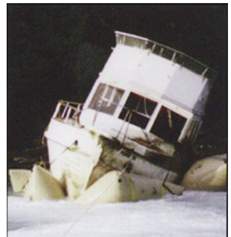
Trawler salvage in shallow water using Enclosed Flotation Bags.